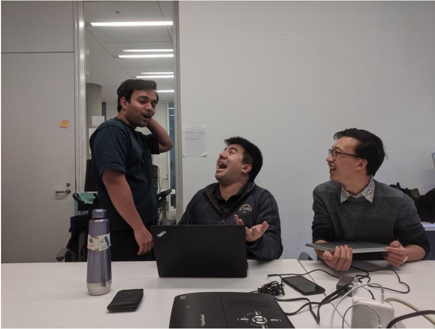
Figure 3. Undergraduate Engineers Trying to Solve Technical Problems