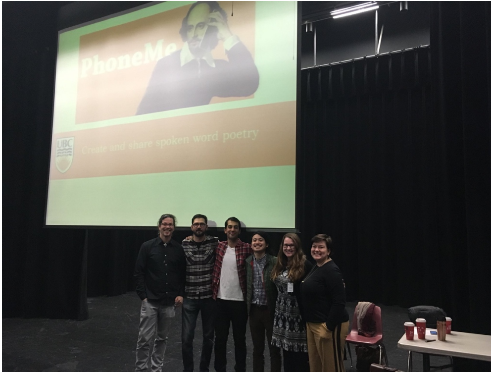
Figure 1. PhoneMe workshops at a public secondary school in collaboration with a former UBC BEd student