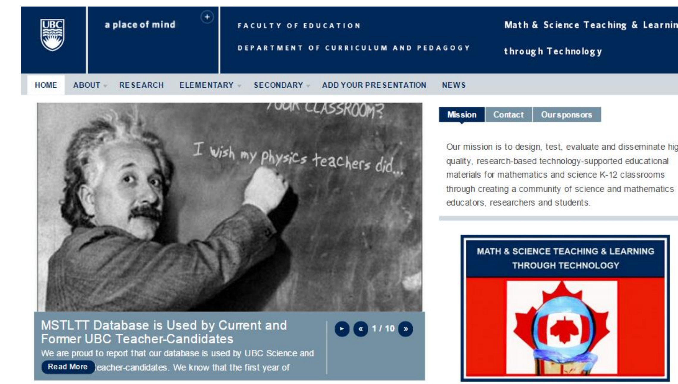
Figure 3: Mathematics and Science Teaching and Learning through Technology database has more than 1000 K-12 resources: http://scienceres-edcp-educ.sites.olt.ubc.ca/ .

It is important to encourage STEM Teacher-Candidates (TCs) to engage with new educational technologies during their practicum and after graduation. To support them in effective technology adoption, TCs have to be exposed to these technologies in their methods courses. They have to experience the benefits and challenges of technology-enhanced pedagogies in a non-threatening learning environment. To make the implementation of new technologies viable, TCs and their instructors also have to have access to research-based materials that support the implementation of these technologies into practice. The TLEF-supported resource: Mathematics and Science Teaching and Learning through Technology is such a database of K-12 research-based pedagogical resources for STEM teaching with technology. It has been used successfully with UBC mathematics and science methods and inquiry courses. The integration of the resource in these courses has made a positive impact on the TCs, expanding their pedagogical repertoire, while helping them acquire positive attitudes about active STEM learning.